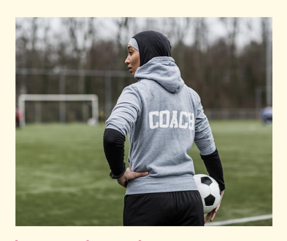
The Workforce – Teachers and Coaches

School Sport and Activity Sector Partnership