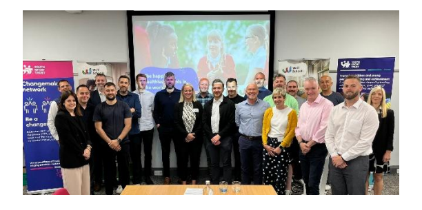
2024 Programme cohort

To find out more about Well School - Well Schools - Wellbeing Resources - Youth Sport Trust